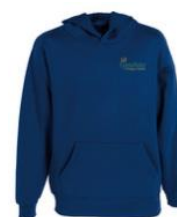
School Blue Hoody (or different sweatshirt to normal day)