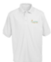
White Polo Shirt