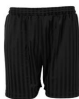
Dark Black/Blue Shorts