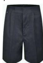
Dark/Grey School Shorts